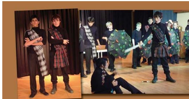
Far Left: Banquo and Macbeth