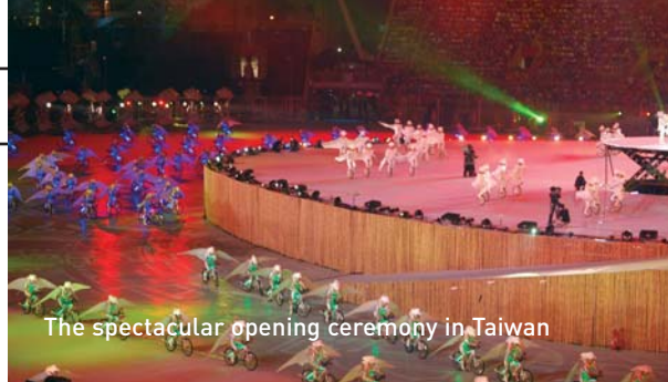
The spectacular opening ceremony in Taiwan